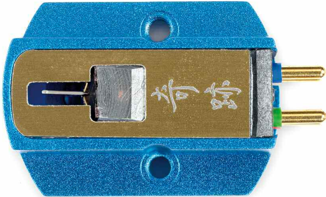
Almost like in the 1980s: but the New Style Kiseki Blue has a shorter body that is compatible with the headshells found on modern tone arms

ring legendary status over the years. With the resurgence of interest in the analogue scene in the noughties, there were sightings of Kiseki stone cartridges such as Lapislazuli or Agate Ruby, which changed hands for the sort of money mere mortals might spend on a car. Many attempted to breathe a new lease of life into their vintage treasures by continually retipping them, but this seldom succeeded in recreating the magic of the original.